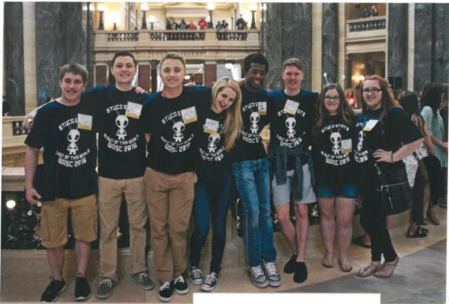
Students from around the state participated in the WASC's annual conference in Madison.

Camp. All providing opportunities for students to learn the necessary skills to effectively share their voice and forums to engage in purposeful change. Learn more at wasc.org/programs-events .