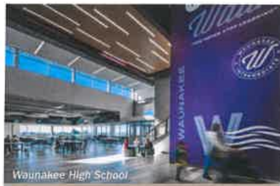
Wauunakee High School

■ Mount Horeb School District made the decision to capitalize on the passion of their students and collaborate with them regarding the “March 14th Walk Out” to remember the lives lost in the tragedy in the Florida school shooting. They invited myself, community leaders, school administration, and students to learn about what the students’ needs were in regard to school safety. They then took time to collaboratively plan an event focused on student voice and advocacy. Mount Horeb Student