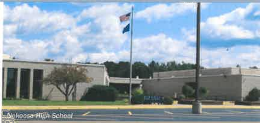
Nekoosa High School

There are a number of schools and community organizations engaging in authentic, student voice initiatives. Here are a couple setting the bar in Wisconsin.