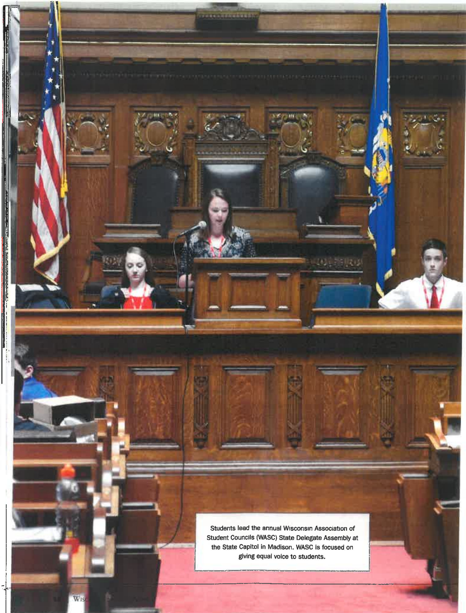
Students lead the annual Wisconsin Association of Student Councils (WASC) State Delegate Assembly at the State Capitol in Madison. WASC is focused on giving equal voice to students.